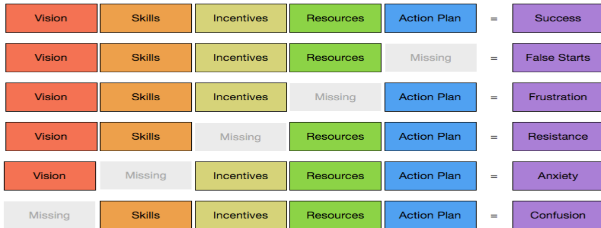
Model for Managing Complex Change